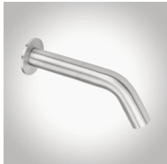
DS103.180.2 (Mirror Polished)